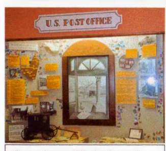
One of over 30 displays of local history in the Hall of History. This museum of Moniteau County history

Resources for genealogy were first housed